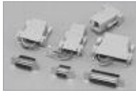
Color: Gray Built to USOC Color Code