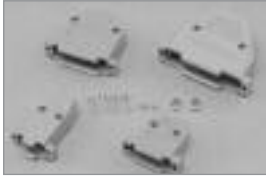
Standard Plastic 'H' Series D-Sub Hoods includes Mounting Hardware, Gray.