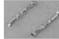
High Density D-Sub Pins for 98 & 99 Series (F) Gold Plated