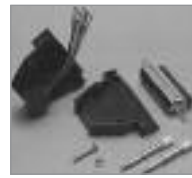
Color: Black Built to Nevada Western Color Code