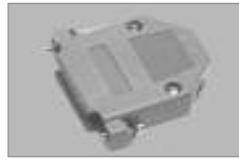
Deluxe Plastic 'HX' Series D-Sub Hoods includes Mounting Hardware & Set Screw to Hold Cable, Gray.