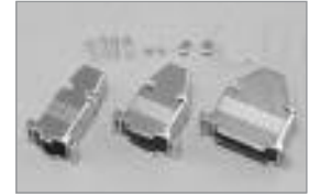
Shielded Metal 'HM' Series D-Sub Hoods includes Hardware, Silver.