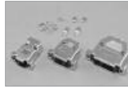
Deluxe Metalized 'HS' Series D-Sub Hoods includes Mounting Hardware, Shield Coating, Silver.