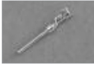
Standard D-Sub Pins for 98 & 99 Series (M) Gold Plated