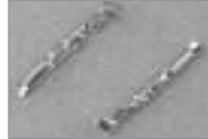
Standard D-Sub Pins for 98 & 99 Series (F) Gold Plated