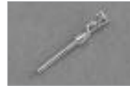
High Density D-Sub Pins for 98 & 99 Series (M) Gold Plated